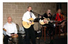
Thank you to Tapestry for providing the entertainment at An Attitude of Gratitude